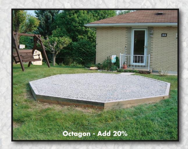
Accepted Methods of Payment Cash or Check Only