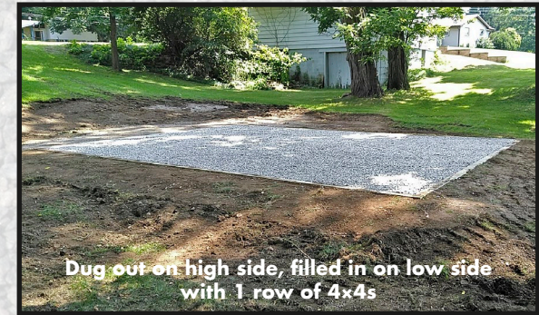
Dug out on high side, filled in on low side with 1 row of 4x4s