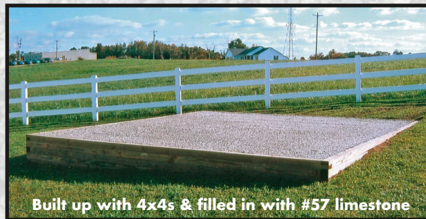
Built up with 4x4s & filled in with #57 limestone

Delivery Zone Pricing: Zone 1 - Above Prices • Zone 2 - Add $150 • Zone 3 - Add $290