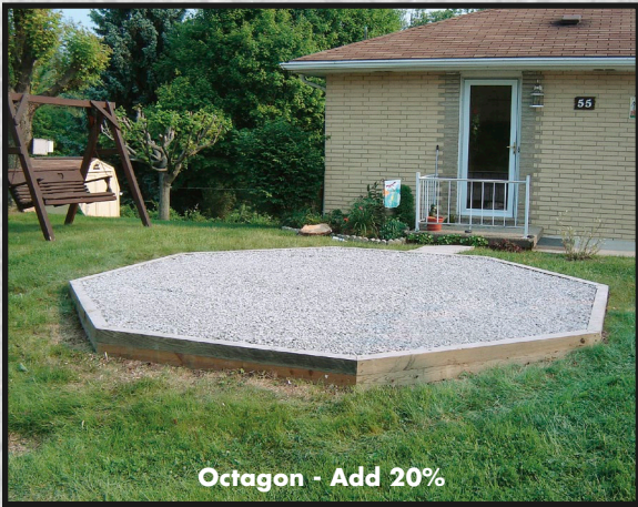
Octagon - Add 20%