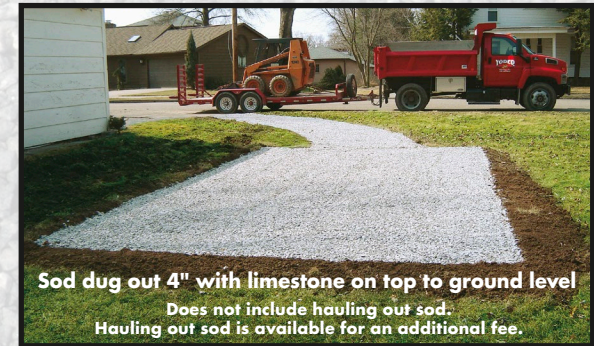
Sod dug out 4" with limestone on top to ground level Does not include hauling out sod. Hauling out sod is available for an additional fee.