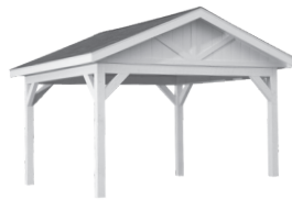
Camden BUILT ON-SITE