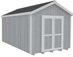
Jackson PREBUILT & DELIVERED