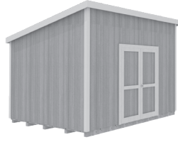
Addison PREBUILT & DELIVERED