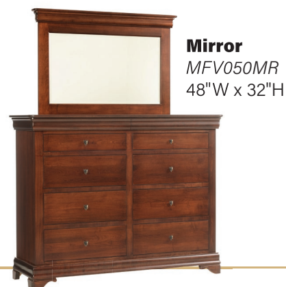
Mirror MFV050MR 48"W x 32"H