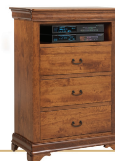
Chest w/ VCR Shelf Shown in Rustic Cherry with Michael's Cherry Finish MFV039CH · 38"W x 23"D x 54"H 4-drawer (one hidden felt-lined drawer)