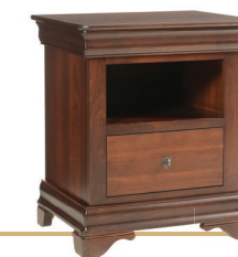
2 Drawer Nightstand Shown in Brown Maple with Rich Cherry Finish MFV025NS · 26"W x 20"D x 30"H 2-drawer (one hidden felt-lined drawer)