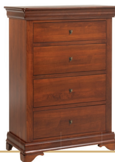
Chest of Drawers Shown in Brown Maple with Mission Maple Finish MFV040CH · 38"W x 23"D x 54"H 5-drawer (one hidden felt-lined drawer)