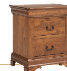
3 Drawer Nightstand Shown in Rustic Cherry with Michael's Cherry Finish MFV026NS · 26"W x 20"D x 30"H 3-drawer (one hidden felt-lined drawer)