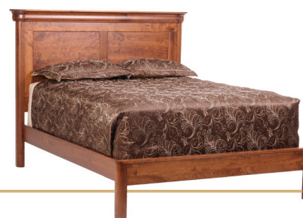
Panel Bed Shown in Rustic Cherry with Michael's Cherry Finish Full VRV035FL 64"w x 83"L Headboard 56" Footboard 17" Queen VRV036QN 71"w x 90"L Headboard 56" Footboard 17" King VRV037KG 87"w x 90"L Headboard 56" Footboard 17"