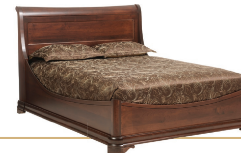
Euro Bed Shown in Brown Maple with Rich Cherry Finish Full VRV025FL 62"w x 82"L Headboard 49" Footboard 20" Queen VRV026QN 69"w x 89"L Headboard 49" Footboard 20" King VRV027KG 84"w x 89"L Headboard 49" Footboard 20"