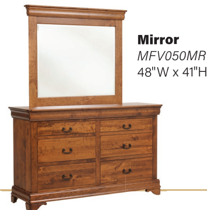
Mirror MFV050MR 48"W x 41"H