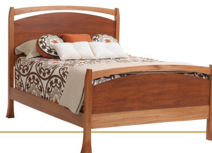
Panel Bed Shown in Lyptus with Mahogany Two Tone Finish Full OAP755FL 60"w x 83"L Headboard 56" Footboard 33" Queen OAP756QN 66"w x 88"L Headboard 56" Footboard 33" King OAP757KG 82"w x 88"L Headboard 56" Footboard 33"