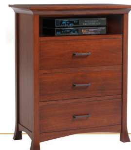
Chest w/ VCR Shelf Shown in Lyptus with Mission Maple Finish MFP739CH · 38"W x 21"D x 47"H