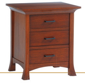
3 Drawer Nightstand Shown in Lyptus with Mission Maple Finish MFP726NS · 26"W x 21"D x 30"H