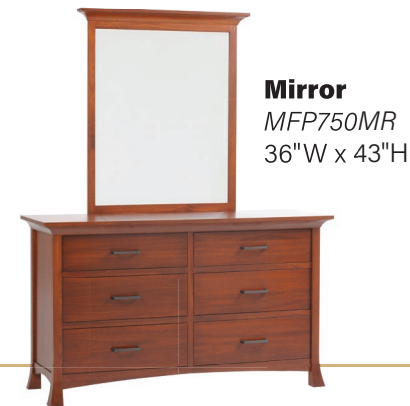
Mirror MFP750MR 36"W x 43"H