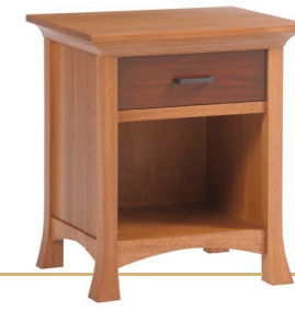
1 Drawer Nightstand Shown in Lyptus with Mahogany Two Tone Finish MPF725NS · 26"W x 21"D x 30"H