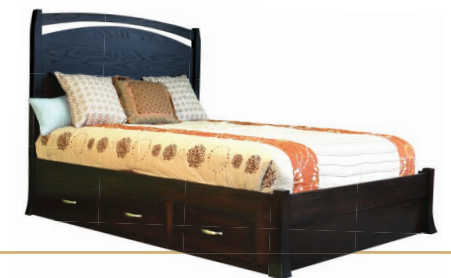
Platform Bed Shown in Oak with Onyx Finish Full OAP075FL 60"w x 83"L Headboard 56" Footboard 16" Queen OAP076QN 66"w x 88"L Headboard 56" Footboard 16" King OAP077KG 82"w x 88"L Headboard 56" Footboard 16"