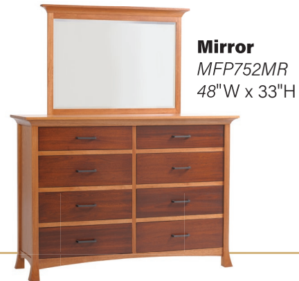
Mirror MFP752MR 48"W x 33"H