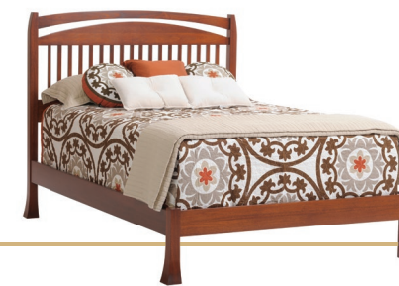
Slat Bed Shown in Lyptus with Mission Maple Finish Full OAP721FL 60"w x 83"L Headboard 56" Footboard 16" Queen OAP722QN 66"w x 88"L Headboard 56" Footboard 16" King OAP723KG 82"w x 88"L Headboard 56" Footboard 16"