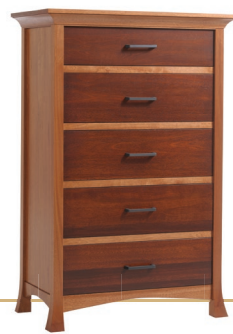
Chest of Drawers Shown in Lyptus with Mahogany Two Tone Finish MFP740CH · 38"W x 21"D x 57"H