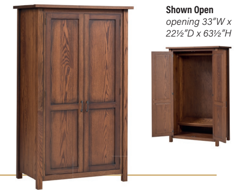
Shown Open opening 33"W x 22½"D x 63½"H