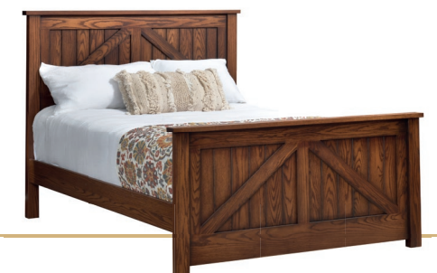
Panel Bed Shown in Sap Oak with Aged Centennial Finish with Black Glaze Full MLM071FL 59"w x 81"L Headboard 54" Footboard 31" Queen MLM072QN 65"w x 87"L Headboard 54" Footboard 31" King MLM073KG 81"w x 87"L Headboard 54" Footboard 31"