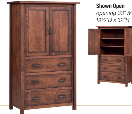
Shown Open opening 33"W x 19½"D x 32"H