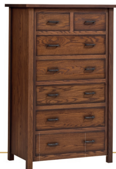
Chest of Drawers Shown in Sap Oak with Aged Centennial Finish with Black Glaze MFM040CH · 40"W x 23"D x 63"H