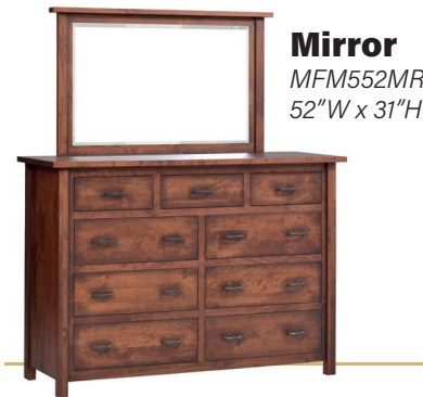
Mirror MFM552MR 52"W x 31"H