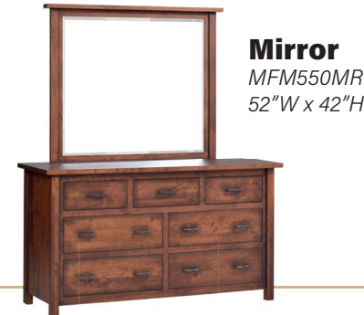
Mirror MFM550MR 52"W x 42"H