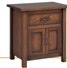
1 Drawer 2 Doors Nightstand Shown in Sap Oak with Aged Centennial Finish with Black Glaze MFM028NS · 28"W x 20"D x 29"H