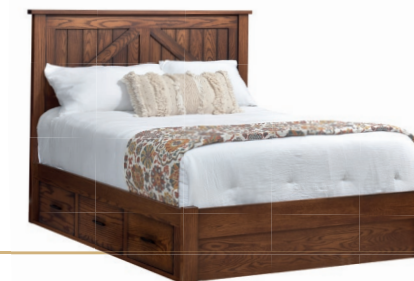
Panel Platform Bed with Drawers Shown in Sap Oak with Aged Centennial Finish with Black Glaze Full MLM076FL 59"w x 81"L Headboard 54" Footboard 16" Queen MLM077QN 65"w x 87"L Headboard 54" Footboard 16" King MLM078KG 81"w x 87"L Headboard 54" Footboard 16"