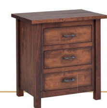
3 Drawer Nightstand Shown in Rustic Cherry with Michael's Finish with Black Glaze MFM529NS · 28"W x 20"D x 29"H