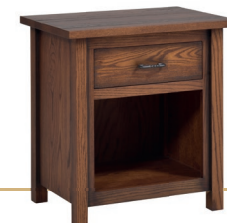
1 Drawer Nightstand Shown in Sap Oak with Aged Centennial Finish with Black Glaze MFM027NS · 28"W x 20"D x 29"H