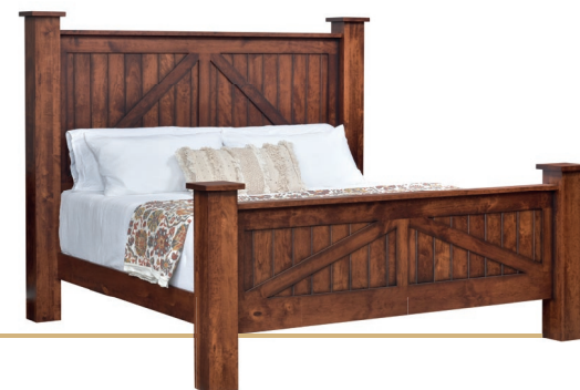
Post Bed Shown in Rustic Cherry with Michael's Finish with Black Glaze Full MLM591FL 69"w x 89"L Headboard 70" Footboard 38" Queen MLM592QN 75"w x 95"L Headboard 70" Footboard 38" King MLM593KG 91"w x 95"L Headboard 70" Footboard 38"