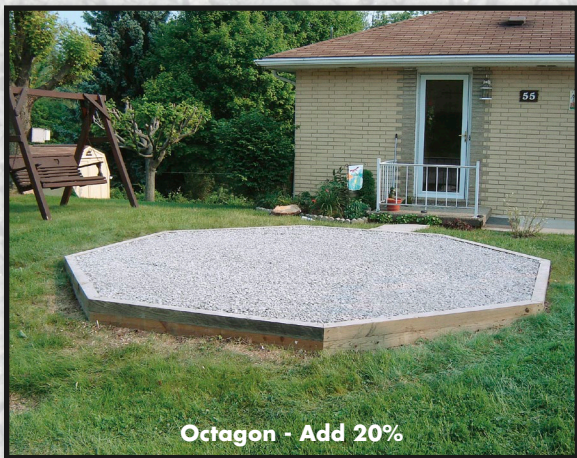
Octagon - Add 20%