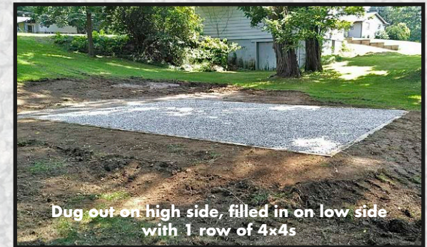
Dug out on high side, filled in on low side with 1 row of 4x4s