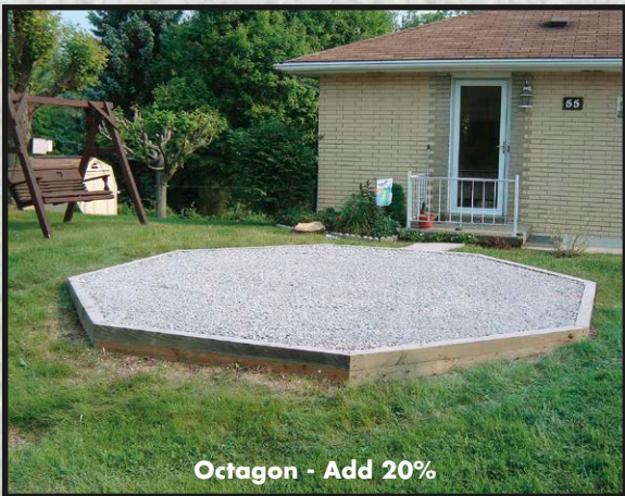
Octagon - Add 20%