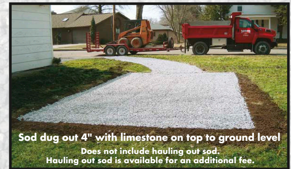
Sod dug out 4" with limestone on top to ground level Does not include hauling out sod. Hauling out sod is available for an additional fee.