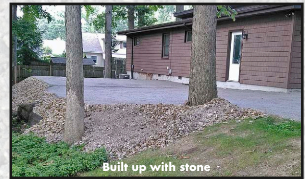
Built up with stone