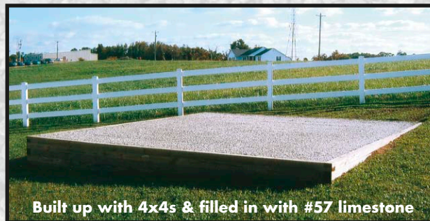
Built up with 4x4s & filled in with #57 limestone

Yoder Site Prep is not responsible for any yard damage.